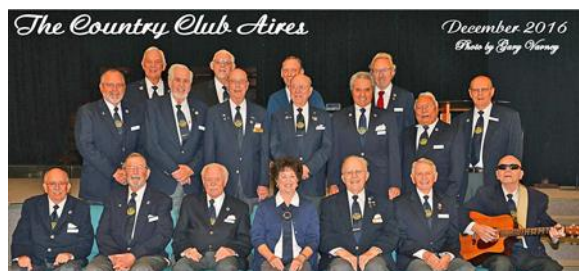
The “COUNTRY CLUB AIRES” (CCA) MEN’S CHORUS & BAND WANT YOU!